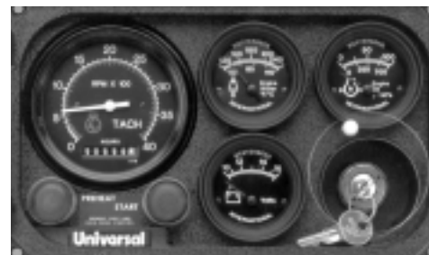
Optional Admiral Panel