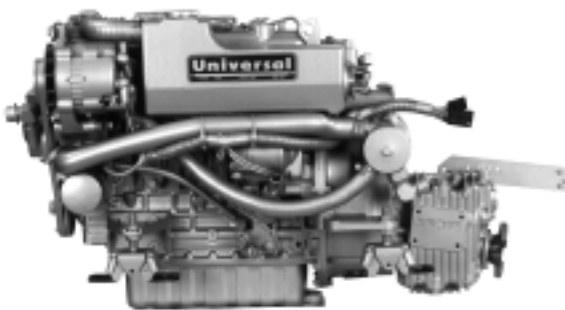
M-40B Diesel Engine

** Universal Atomic-4 replacements are not direct drop-ins in all cases. Some engine compartment reconfiguration may be required.