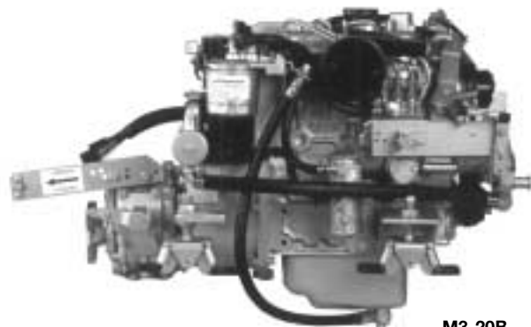
M3-20B Diesel Engine

See other side for more dimension information Photographs may show optional equipment.