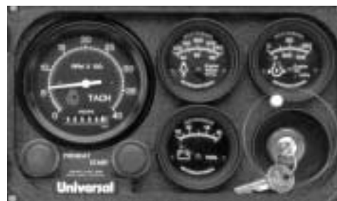
Optional Admiral Panel