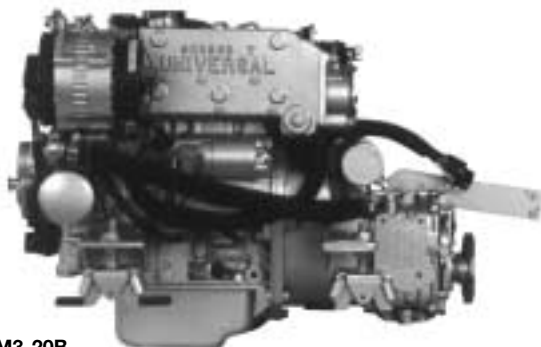
M3-20B Diesel Engine

** Universal Atomic-4 replacements are not direct drop-ins in all cases. Some engine compartment reconfiguration may be required.